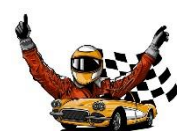
Car race driver