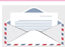
( email - letter )