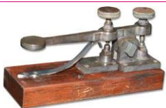
( telegraph - telephone )