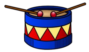
( tone - drum )