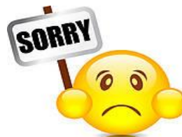
( apologize - import )